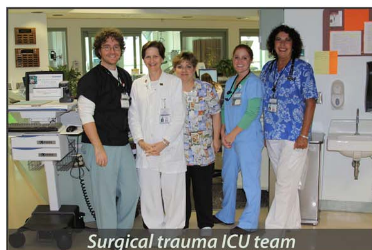
Surgical trauma ICU team