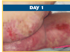
DAY 1 72-year-old patient with severely denuded, blistered skin and extreme pain from incontinence.